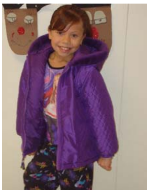
Photo Gallery—students and teachers at Parker/Burnet Elementary enjoy the gifts for students