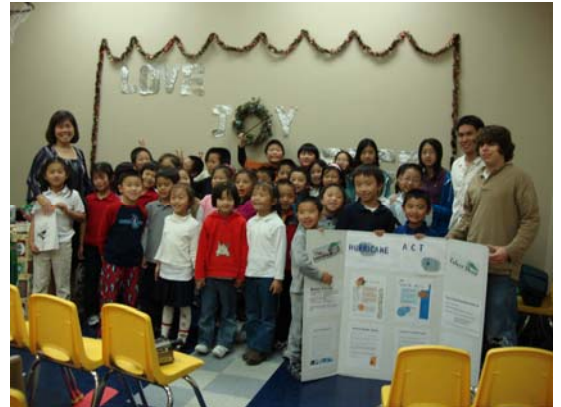
The Learning Skool-House Afterschool dedicated its annual talent show to help Galveston students